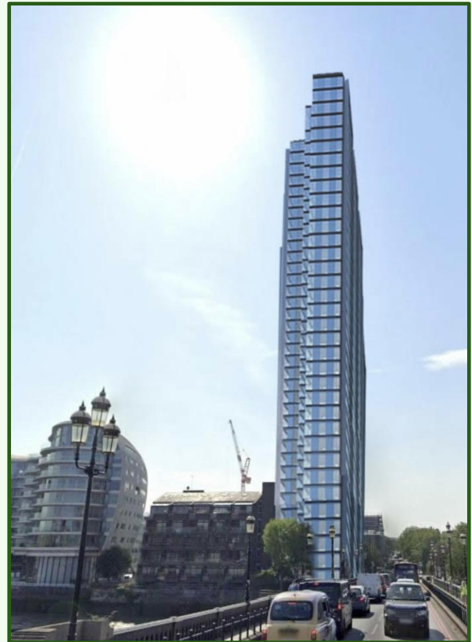
Glassmill Skyscraper: 35-storey tower proposed at southern end of Battersea Bridge dwarfing old Chelsea and the historic Houseboats