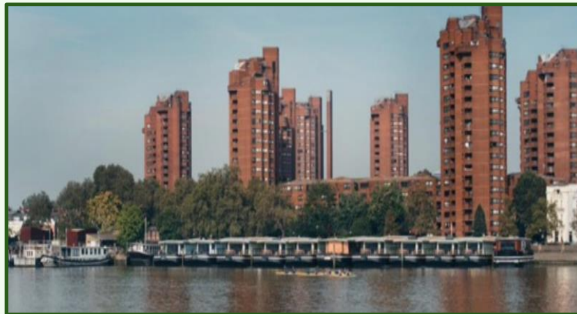
Chelsea Houseboats: Mega apartment barges planned to replace historic houseboats